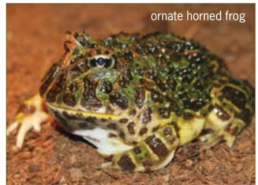
ornate horned frog