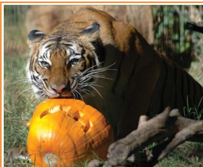
Tigers and other Zoo animals enjoyed pumpkins during our Stomp ‘n’ Chomp enrichment day October 25. The Zoo also welcomed its 400,000 visitor for 2008 on that day, the first time Fresno Chaffee Zoo has exceeded 400,000 visitors in at least 15 years.

to be exciting to come back here in a few years and see what’s been done. In this setting with the trees and this magnificent park...a lot of zoos don’t have this.” 🌿