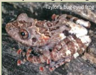
Taylor's bug-eyed frog

A Well that depends on your definition of "significant." Honestly, we consider every birth or hatching here at the Zoo as significant, since it indicates that we're giving our animals what they need biologically, socially, and psychologically to reproduce properly. I'd have to say that one of the most significant of the year was our hatching and subsequent metamorphosis of Taylor's bug-eyed frogs. Not only was this a first breeding here at our Zoo, this was the first time this species had reproduced in any institution in the U.S. These animals are not yet on exhibit in the reptile building at the Zoo, but we hope to be able to exhibit them in the not-too-distant future. 🐸